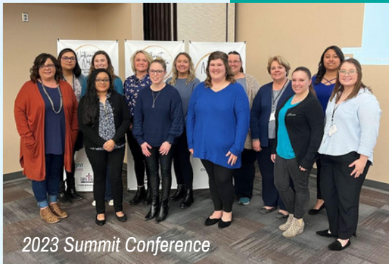
2023 Summit Conference

We have a wonderful line up of speakers you don't want to miss!!