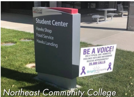
Northeast Community College

"Bright Horizons staff does an excellent job at providing a safe space. I feel that they truly care about our safety and they demonstrate it in many ways. They are helpful and the rides to places are very helpful."