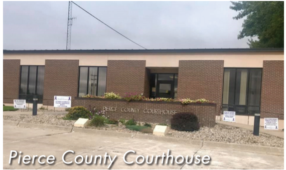
Pierce County Courthouse