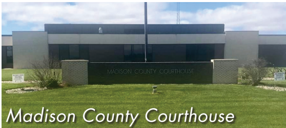
Madison County Courthouse