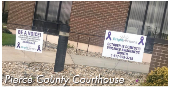
Pierce County Courthouse